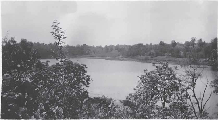
Photo 7 shows a view of what might be the French's property and North Beach. Under magnification, there are some structures visible, including what might be a home and barn.

The back of photo 9 reads: "Me on the dam at Indian Lake near Oaklandon. By Keith Perkins, June 9, 1936."